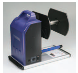
Stylish appearance plus a rugged design for long term reliability