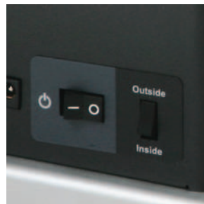
Rewinding direction switch to rewind "inside or outside" label rolls