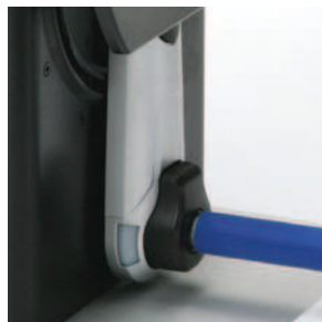
Colored LED indicator provides rewriter operation status